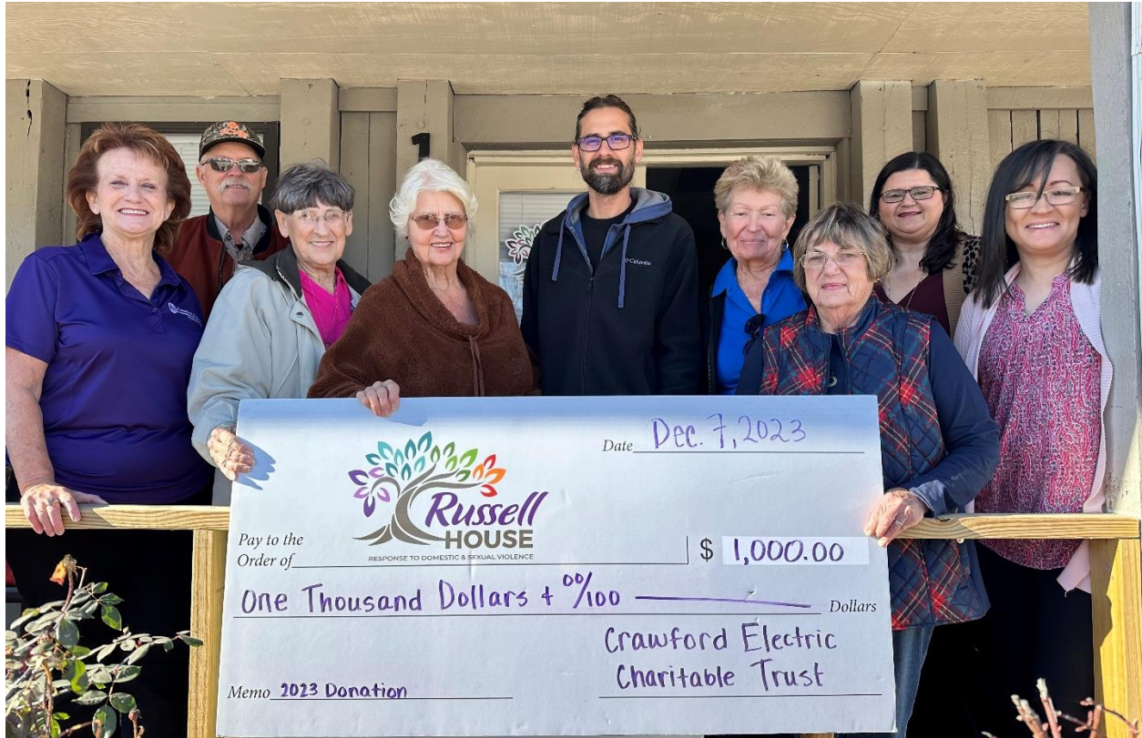
Operation Round Up's Charitable Trust Board presents a grant to Russell House at the non-profit's community outreach building in Steelville.